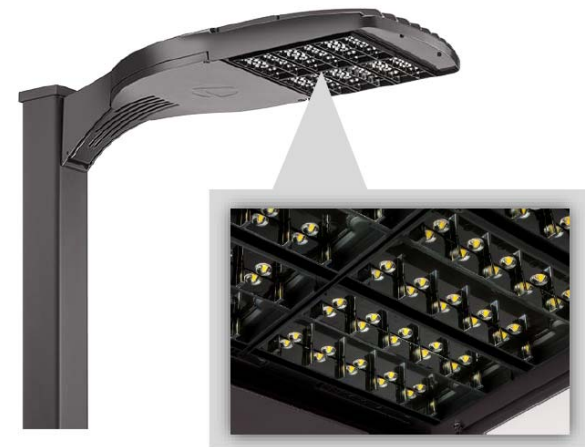
Backlight Cutoff (BLC)